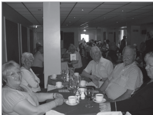
Guests at the Blackpool lunch

We are planning Summer Lunches in Blackpool on Saturday 12 June and Bridlington on 11 July and if anyone would like to arrange an event elsewhere in the country we would be pleased to provide financial support. We can also offer grants for groups who wish to arrange outings. Please contact the office at CLT, PO Box 618, Halifax HX3 8WX or e-mail info@cancerlt.org for a Grant Request form.