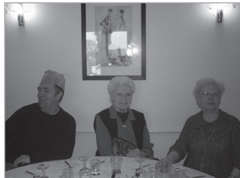
West Yorkshire Christmas lunch