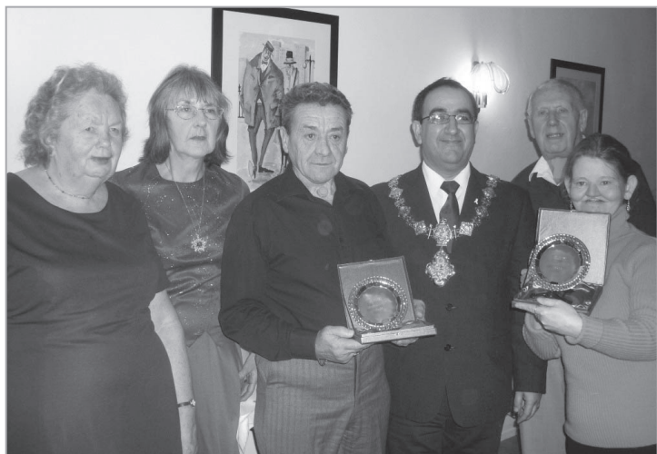
Race and Raffle Prize Winners at Halifax Lunch