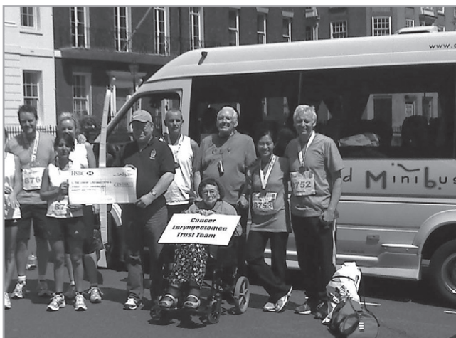
Our Team in 2009 Race

Individual runners must complete the registration form (available from CLT, PO Box 618, Halifax HX3 8WX or info@cancerlt.org ) which contains our Charity Race Ref No P937 and return the form to CLT. These entries will then be entered on-line via the race website. We can amend the on-line registrations and make substitutions before the date up to Friday 2nd July.