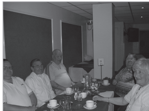
Guests at the Blackpool lunch