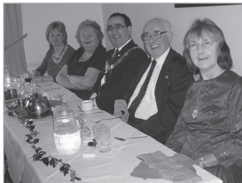
West Yorkshire Christmas meal top table