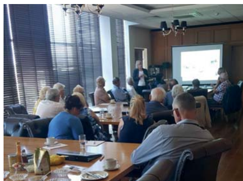
A photo from a recent Atos Medical and Countrywide Supplies community event in Blackpool

Upcoming themes include Better Sleep which focuses on ideas for getting quality rest and an event around the topic of travelling as a larygectomee.