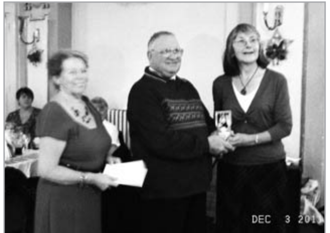
Caption Prize Winners receive their Trophies