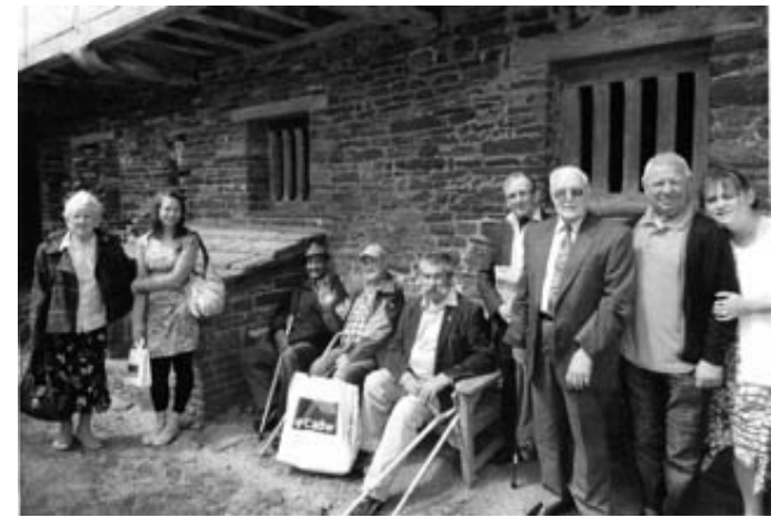
Swallow Club Members at Tretower Castle

For our club outing in July we visited Tretower Court and Castle. The castle is of historic interest, originally built in 1121 and added to by the construction of the Tower and extensions to the Castle up to about 1240. At about 1450 a new and more fashionable residence was built within the shadow of the Castle which became known as