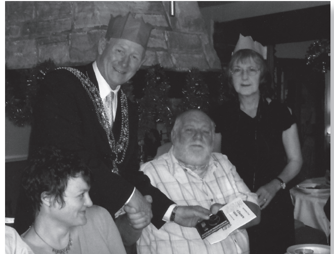
Mayor of Calderdale presenting Race Trophies (more photos on page 4)