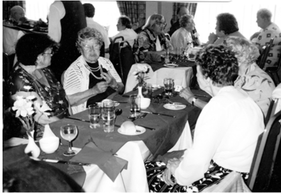
Guests enjoying the Blackpool Lunch

over expenditure. As the Charity receives no support from Government agencies we are always very appreciative of donations, grants or legacies which enable the Charity to continue its work.