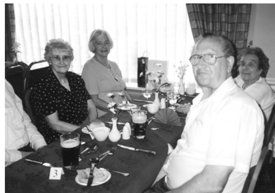
Wigan Members at the Blackpool Lunch