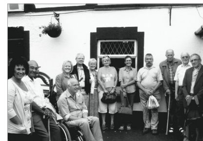
Swallow Laryngectomee Club outing