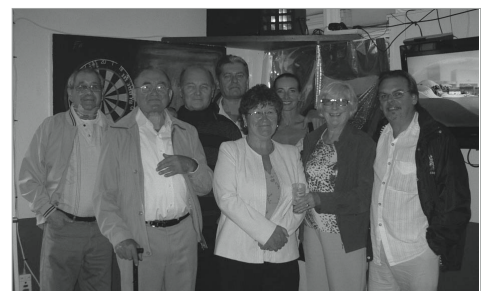
Talk Club in Berwick