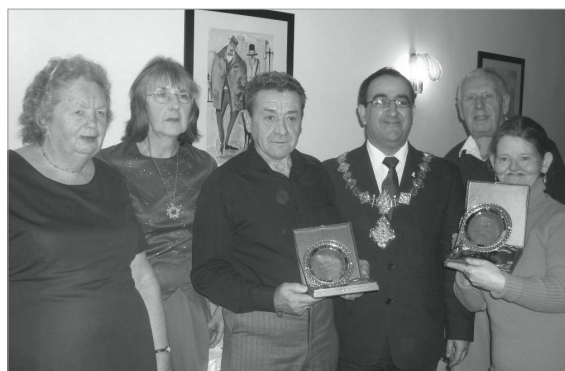
Winners Race Night 2009

We MUST stress however, that if, for whatever reason, you are unable to participate or do not feel that you can sell to others, that you are under NO OBLIGATION to do so and need not return the books to us. We fully understand that people's circumstances are different, that they may have moral or religious objections and that some of our members are less mobile than others.